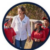
Build skills through fun